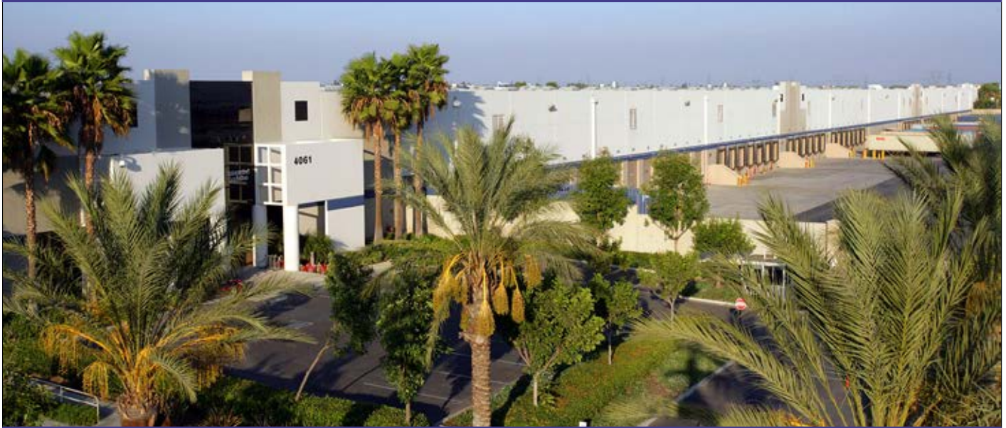
4061 E. Francis Street, Ontario, CA